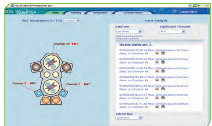
TOOLweb® RGA Screen Home page for a tool with two 300mm Resist-Torr® degas modules. The dashboard view presents a complete status report and automated alarm analysis on one page.

Using TOOLweb RGA sensor integration option for process tools, the 300mm Resist-Torr can be used as a degas chamber sensor in a completely automated process environment. TOOLweb RGA maintains a constant monitor of tool activities with all sensor data being framed by wafer logistics before alarm models are applied. Full alarm and data reporting to the FAB host and FDC are available so real time monitoring of chamber conditions and flagging of any process excursions from ideal conditions is possible.