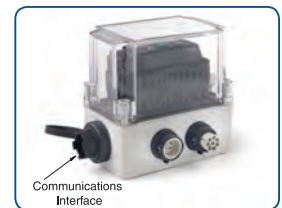
Figure 2 - Communications Module

The Communications Module (Figure 2) includes all the functionality of the Display Module, but adds Modbus® RTU communications with an RS485 interface. This allows users to remotely adjust the operating parameters and monitor heater operating status. The temperature controller is housed inside a protective NEMA 4X-rated enclosure that is resistant to water and dust. The enclosure is also resistant to corrosion and damage from ice buildup.