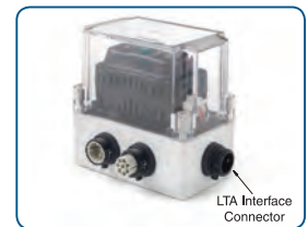
Figure 1 - LTA Module

Temperature controllers are also available in two options: a Low Temperature Alert (LTA) or a Communications interface. The LTA Module (Figure 1) includes an access port for the dry-contact relay. This provides a remote signal indicating whether the heater is within or outside of the preferred temperature range. The temperature range is user-adjustable. When the heater is within this preferred temperature range the relay is in a closed state. When the heater is outside the temperature range, either above or below, the relay will be in an open state.