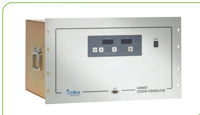
AX8407A, B, HC Ozone Generator