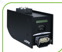
ASTRON ® 2L