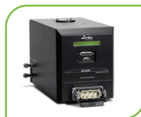
ASTRON ® i