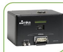
ASTRON ® ex